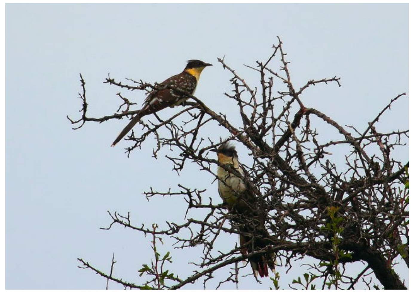
Great Spotted Cuckoos