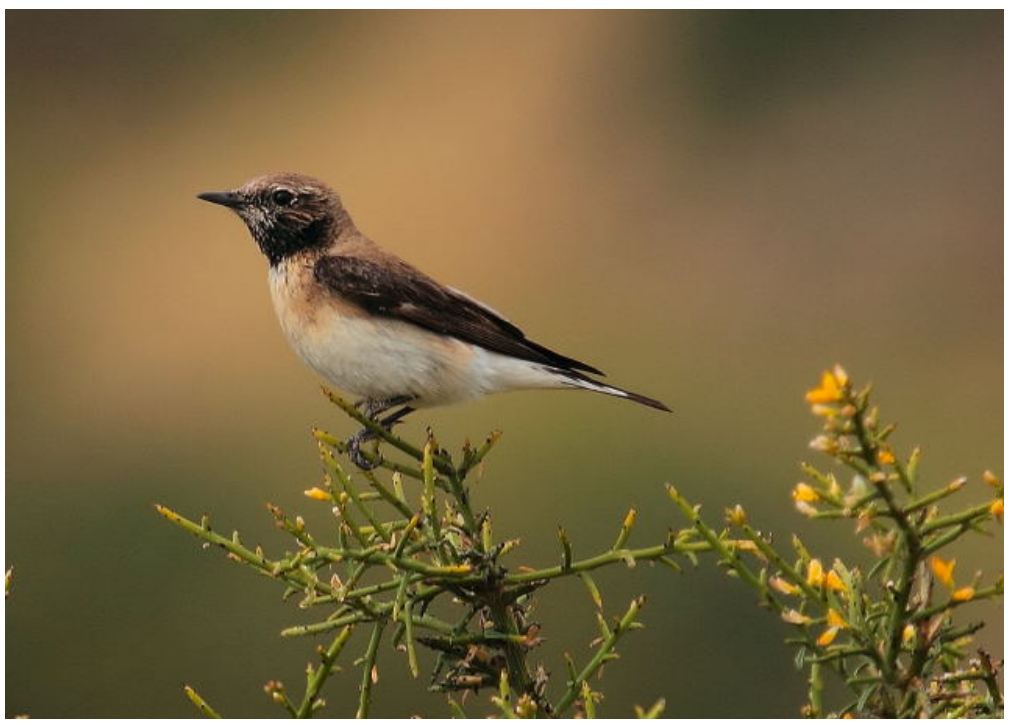
Juvenile Black-eared Wheatear