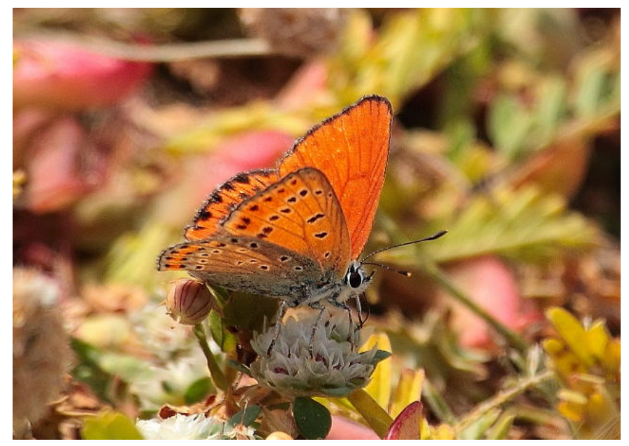
Lesser Fiery Copper